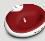
1 Liter MRSP US$54.95